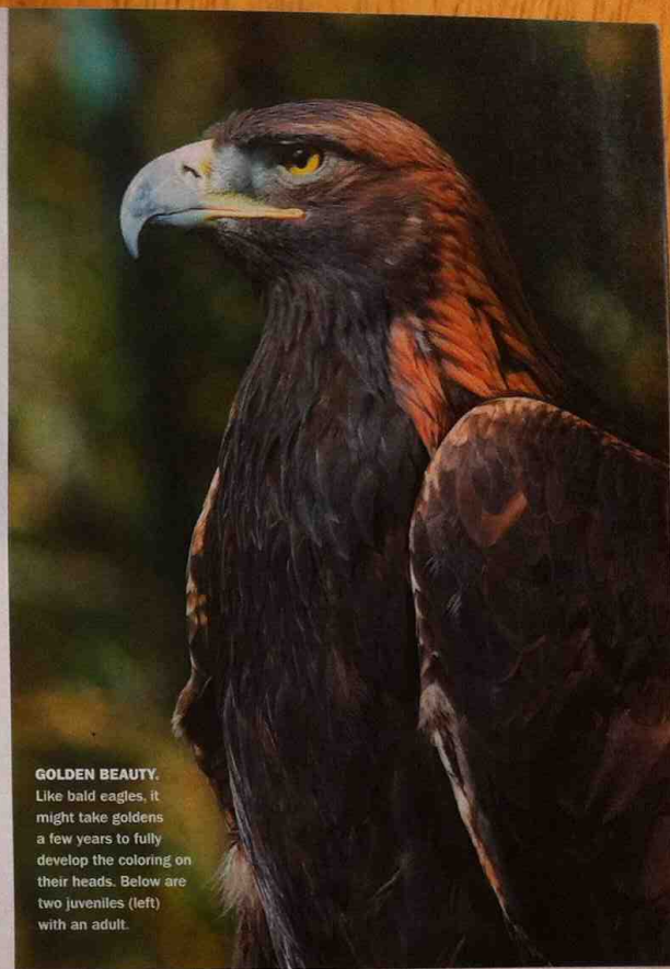
GOLDEN BEAUTY. Like bald eagles, it might take golden eagles a few years to fully develop the coloring on their heads. Below are two juveniles (left) with an adult.

I mentioned passion because there is just something about golden eagles. Perhaps it has to do with where they live: the sweeping deserts of the Southwest, the peaks of the Rockies and the glacier-clad mountains of Alaska. Or perhaps it is their size, speed, agility, grace and guts that make them seem so extraordinary and enduring.